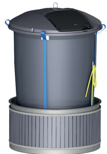
Lifting stage 1

Inspect the bag visually during emptying. Any broken or damaged parts must be immediately reported to the container owner. Small cuts or holes in the bag are permissible.